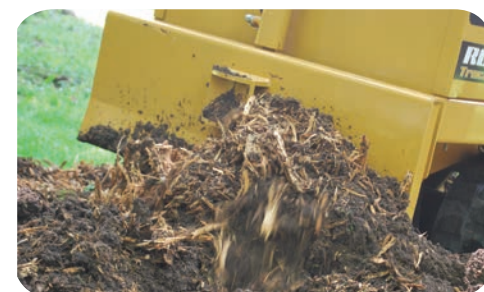
Hydraulic Backfill Blade Standard