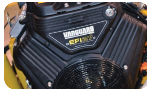
37hp Vanguard Engine