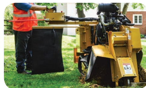
Swing-Out Chip Retainer Curtains