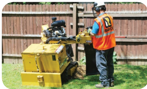
Swing-Out Control Station

When you need a compact stump cutter with the go-anywhere traction and floatation only tracks can provide, the Trac Jr is your solution. This Rayco-exclusive design raises the bar for compact stump cutters by offering a small machine that is truly full-featured. Rubber tracks provide excellent traction and ground pressure of less than 4 psi. Huge, 51-inch cutting width tackles big stumps and a hydraulic backfill blade makes easy work of clean-up. Only Rayco gives you a swing-out control station to provide excellent visibility in the cutting position and making for easy travel through gates in the travel position.