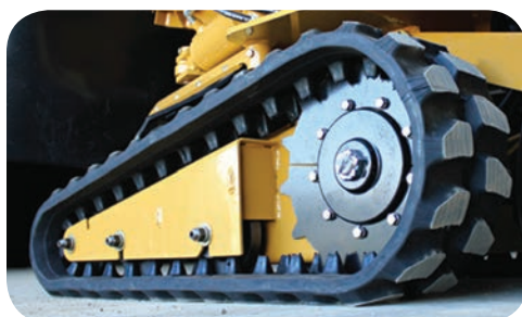
Rubber Track Undercarriage - Available with Non-Marking Rubber Tracks (option)