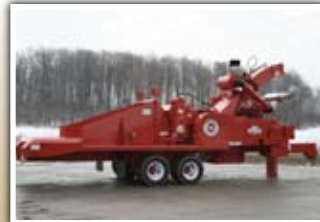
MODEL 30/36 NCL If you already own support equipment the Model 30/36 without a cab and loader is an affordable option.