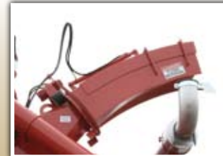
DISCHARGE Directional flow discharge chute is hydraulically adjustable by remote control for maximum chip loads.