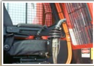
OPERATOR'S CAB All weather cab provides optimal comfort during operation.